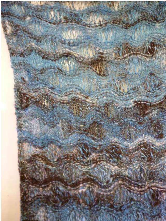
Texture and colour