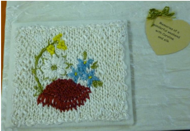
Memento of the day