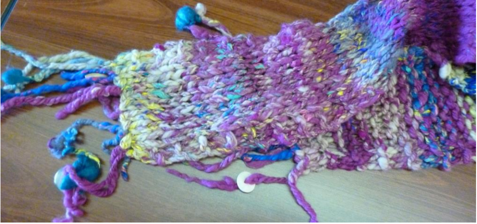
Texture and colour