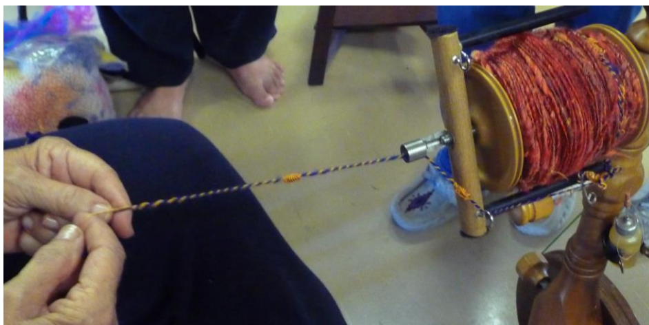
Novelty yarn – nobs