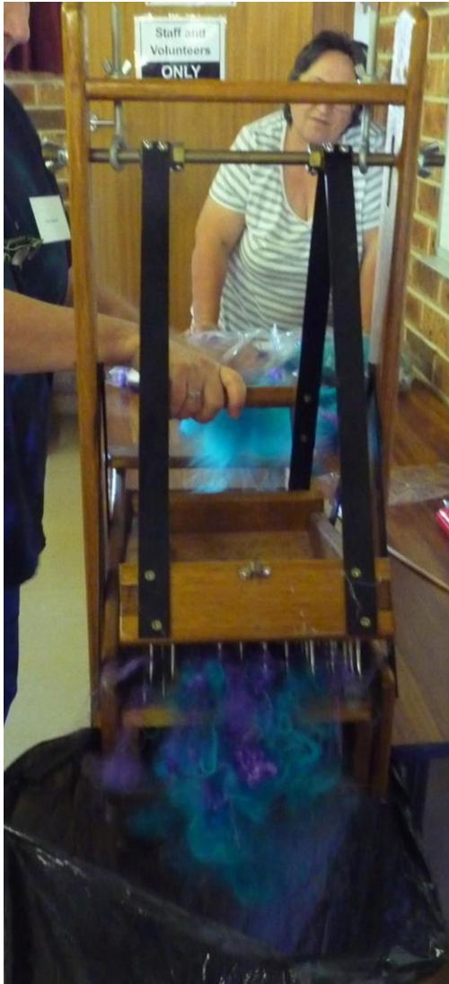
The Picker - used for blending fibres