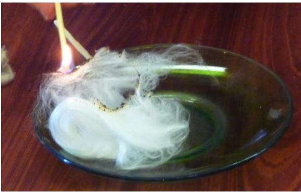
Burn testing fibres