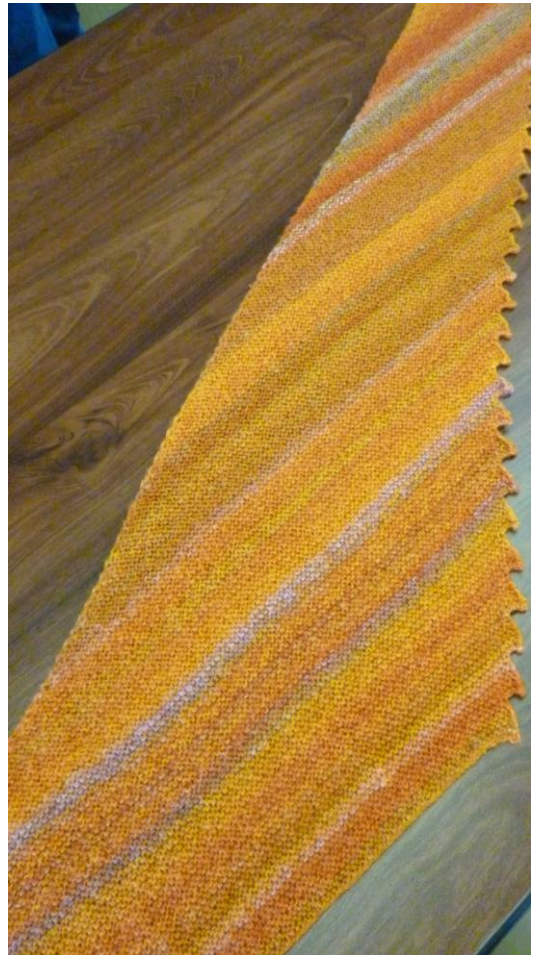
Unique design and colour